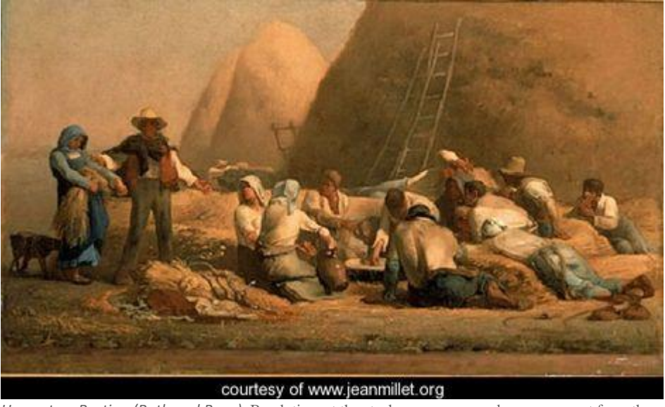
Harvesters Resting (Ruth and Boaz) Break time at the stacks, as reapers and wagoners rest from the afternoon heat. Small bundles of grain were hand-sickled, bound and stacked, then gathered by wagons to larger stacks awaiting final threshing of grain.

The idyllic scenes depicted here by mid-nineteenth century artists serve as our photographic link to the era. They captured rural French life only partially realistically, from the sense of sight, depicting for the bourgeois urban folks a romantic idea of how beautiful, simple, and easy life in the country was. What they missed was the ability to record the temperature, the aching backs, the sense of desperation as every