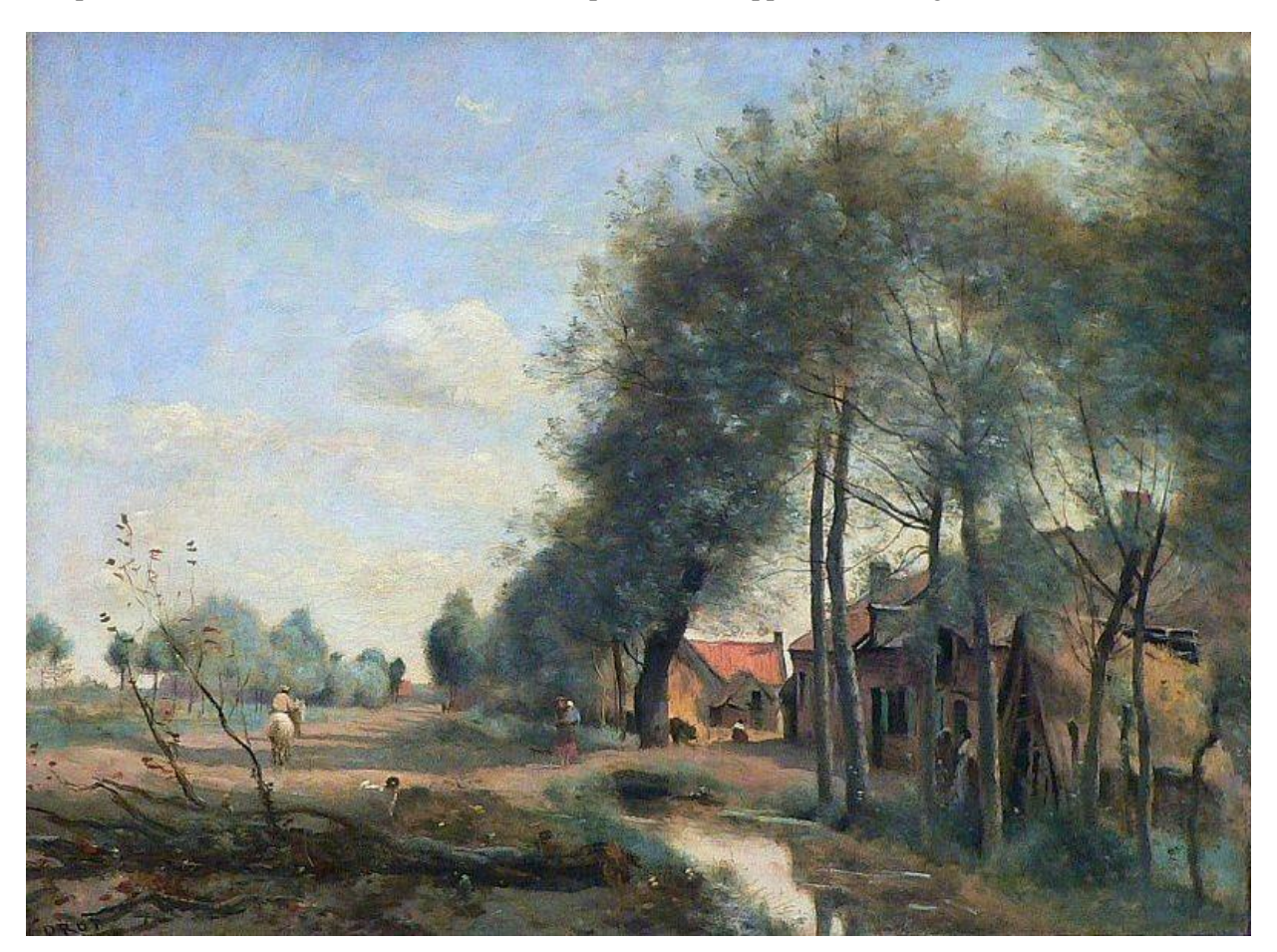
A peasant village scene, early nineteenth century France, a small collection of thatched hovels, clustered together for protection, with fields set apart outside the village.

diseases that could wipe out a family or a village in a season. They lived at a time when every married woman bore on average nine to twelve children, only half of whom reached adulthood. Their farms were mercilessly assaulted from many sides: wild animals, wolves especially, could decimate a flock or herd; the tax collectors were always inspecting barns, larders, pens, and stacks – even measuring the height of manure piles - to gauge the true extent of a family's prosperity for purposes of extracting more taxes. And worst of all, an armed cavalry at any time could drive their horses, wagons, and following cannons through their crops, destroying their season's work in an afternoon or single bivouac – all without compensation. In fact, ancient Salic law forced peasants to support marauding armies.